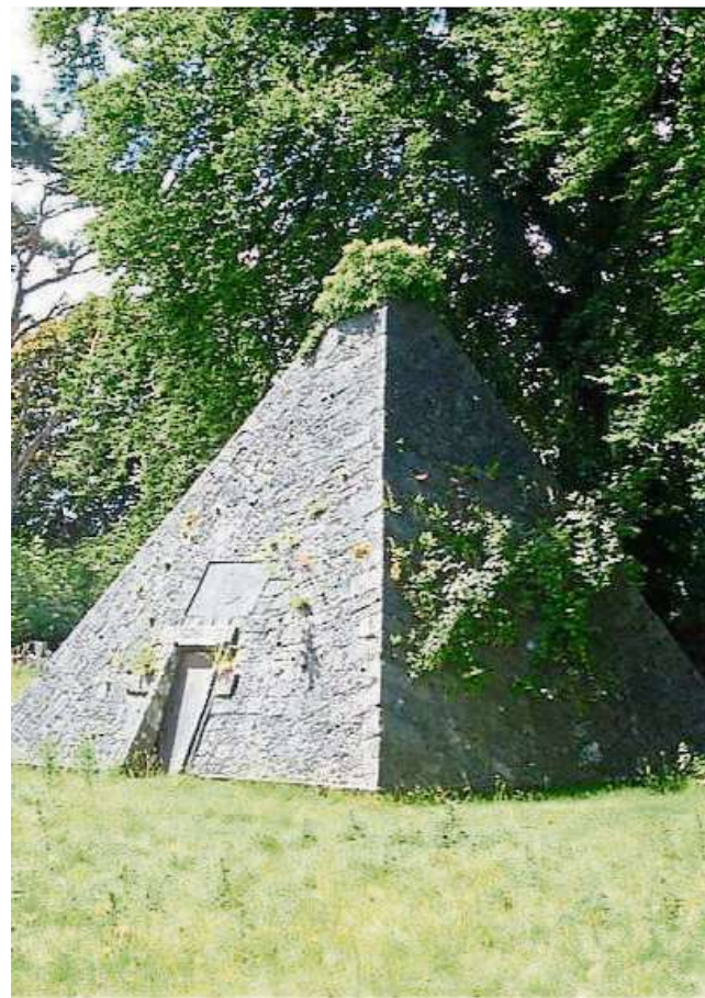
One of the pyramids in the Maudlins Cemetery on the Dublin Road out of Naas.